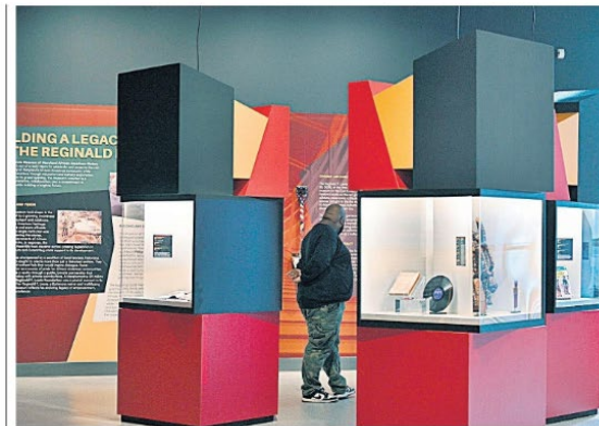
A visitor checks out "Titan: The Legacy of Reginald F. Lewis," the ongoing special exhibit at the Reginald F. Lewis Museum. The museum has struggled with attendance.

The plant, located in the unincorporated community of Morgantown, currently includes four active oil-fired power plants and two retired coal plants, and generates 216 megawatts of power, enough to power about 172,000 homes each day. That power goes into