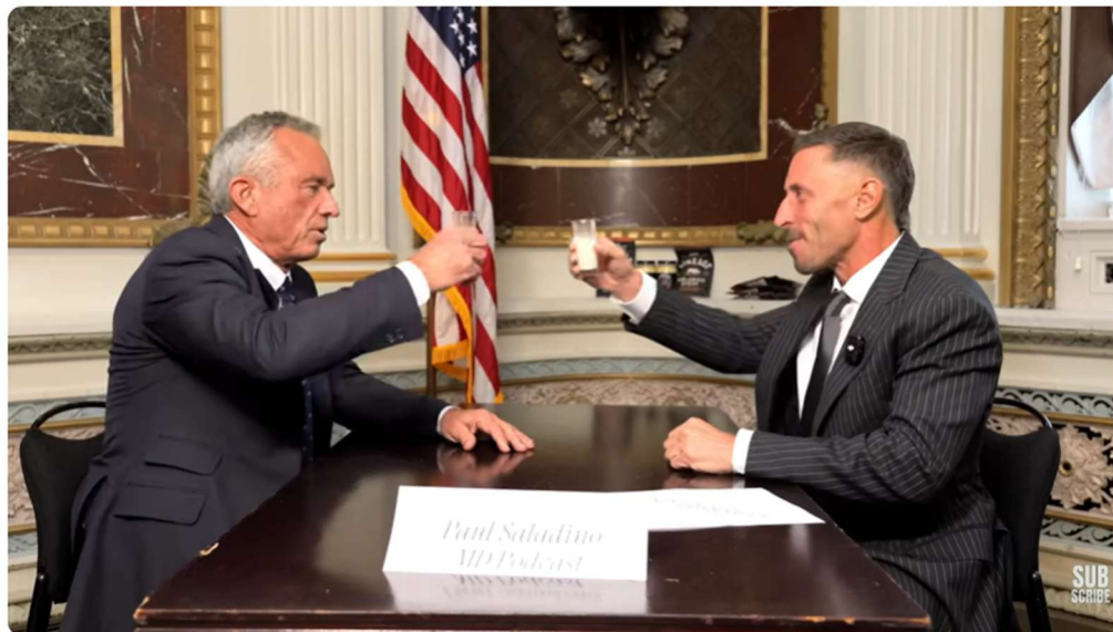
RFK Jr. on the REAL Cause of the Chronic Disease Epidemic

Secretary Kennedy and Paul Saladino drink raw milk shots in the White House, May 2025 ( source : "RFK Jr. on the REAL Cause of the Chronic Disease Epidemic," YouTube.)