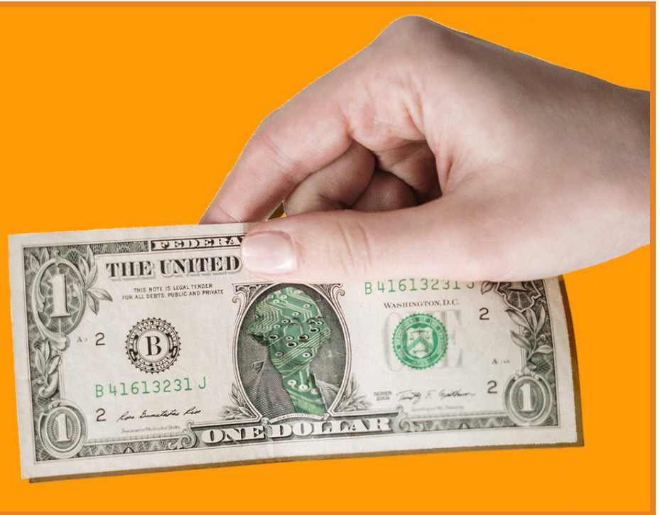
Graphic courtesy of Zach Stone.

We led an international coalition that spent the first half of 2021 pushing back on a set of privacy-violating data collection practices Facebook