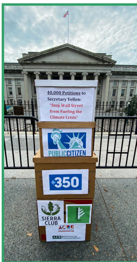
In October, Public Citizen and other groups delivered more than 40,000 petition signatures to U.S. Treasury Secretary Janet Yellen demanding climate action.

Along with partner organizations, we also influenced the creation and execution of the Executive Order on Climate Related Financial Risk, which President Joe Biden issued in May. The president directed the U.S. Department of the Treasury to issue a report on climate-related financial risk, which we worked to influence and strengthen. ■