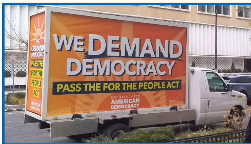
A mobile billboard circles the U.S. Capitol in Washington, D.C., during "Democracy Week" to underscore the importance of the For the People Act to ensure a robust democracy.

In 2022, we will celebrate Public Citizen's 50th anniversary. Even as we look back on the past fifty years of being on the frontlines of advancing consumer protection, health and safety, and justice and democracy rights, we are redoubling our efforts to move us closer to a nation of opportunity and justice for all. ■