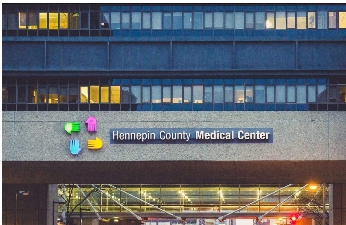
Photo of a Hennepin County Medical Center skyway in Minneapolis, Minn., courtesy of Tony Webster / Flickr.