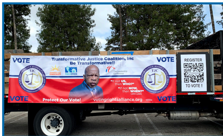
A votercade winds its way through Los Angeles, Calif., on the National John Lewis Voting Rights Advancement Action Day.