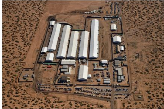
Camp East Montana, an ICE immigration detention center in Fort Bliss in El Paso, Texas, is seen on Oct. 1, 2025. The facility was set to hold up to 5,000 adults scheduled for deportation.