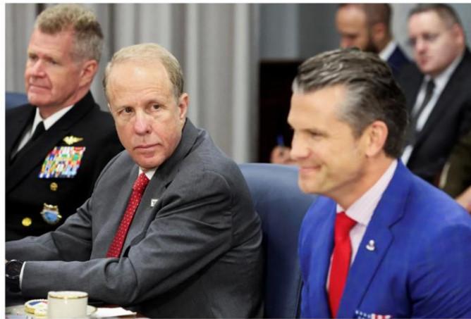
Deputy Secretary of Defense Steve Feinberg, center, with Defense Secretary Pete Hegseth, right, at the Pentagon in 2025.

There do not appear to be close political ties between Amentum and Donald Trump. However, the owner of one of the major companies that Amentum purchased in 2020, DynCorp International, has had very close ties to President Trump. In 2010, Cerberus Capital Management acquired DynCorp. for $1.5 billion. 112 Cerberus' co-Chief Executive Officer (CEO), Stephen Feinberg , has been an active supporter of Donald Trump. 113 During the 2016 and 2020 Presidential elections Feinberg reportedly donated a reported $3.2 million to pro Trump PACs. 114 In addition, during Donald Trump's run for the Presidency in 2016, Feinberg served on Trump's Economic Advisory Council. 115 In May 2018, President Trump named Feinberg the Chair of the President's Intelligence Advisory Board. 116 More recently, during his second term in office, President Trump nominated Feinberg to be the Deputy Secretary of Defense and he was sworn into that position in March 2025. 117 He is seen below seated next to Defense Secretary Pete Hegseth.