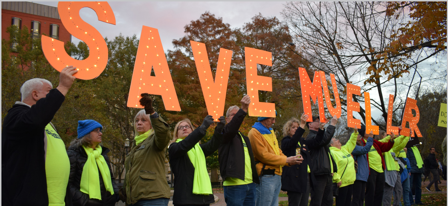
Citizens participate in the “Nobody Is Above the Law” protests in Washington, D.C., in November against President Donald Trump’s effort to undermine Special Counsel Robert Mueller’s investigation by firing Attorney General Jeff Sessions.

2018 was marked by unprecedented challenges. We faced an administration hostile to the rule of law, dominated by corporate interests, rife with authoritarian tendencies, dismissive of ethics and scornful of facts.