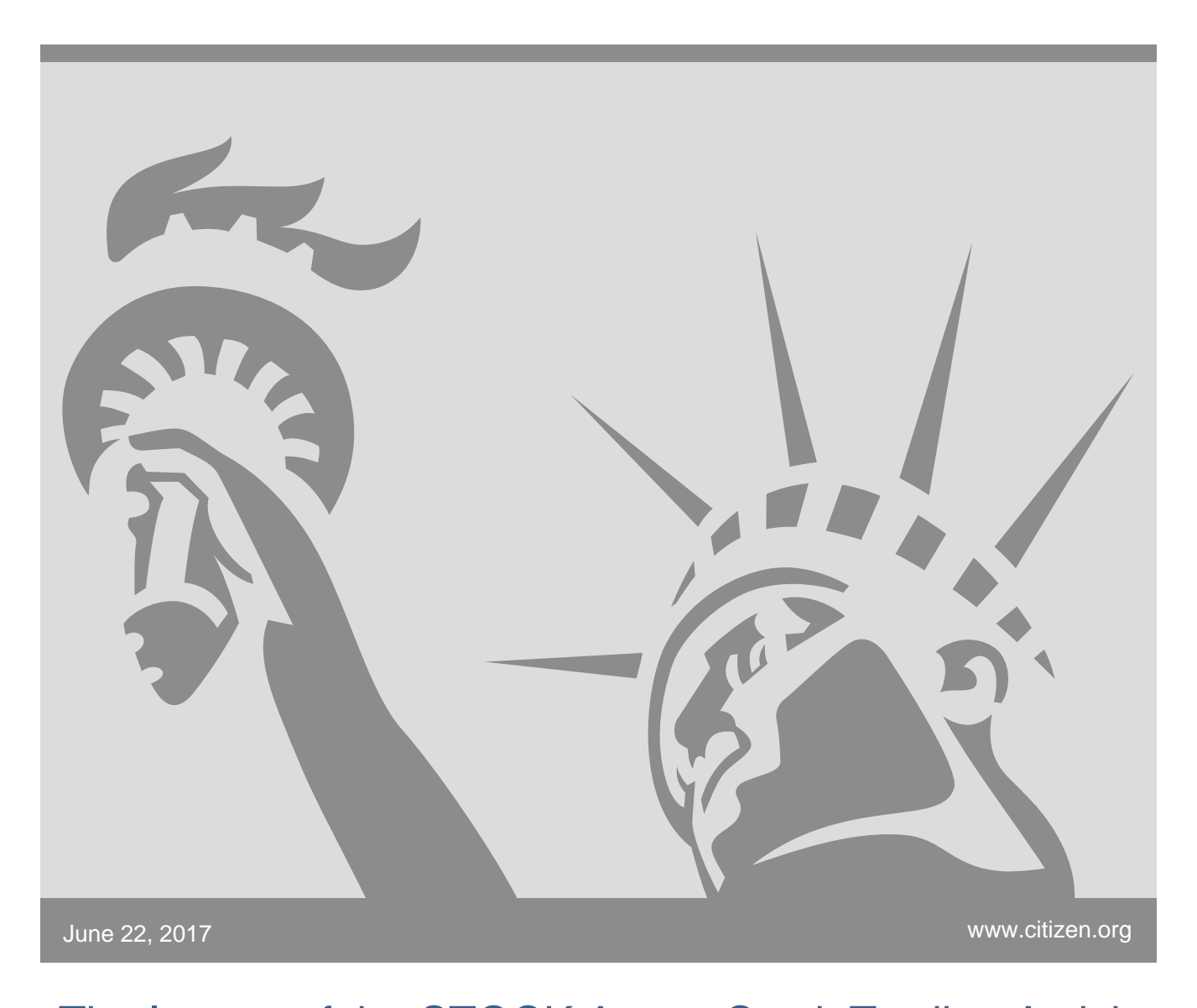
The Impact of the STOCK Act on Stock Trading Activity by U.S. Senators, 2009 – 2015

A significant improvement, but the ethics law needs to be strengthened