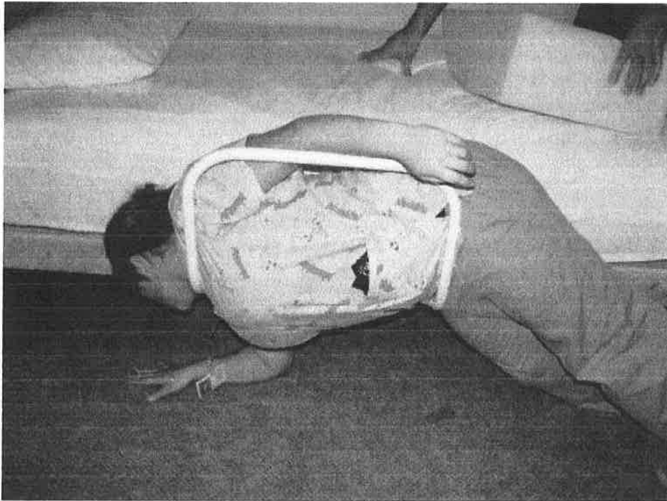
Photo # 9: View of the Caregiver demonstrating the position of the victim.