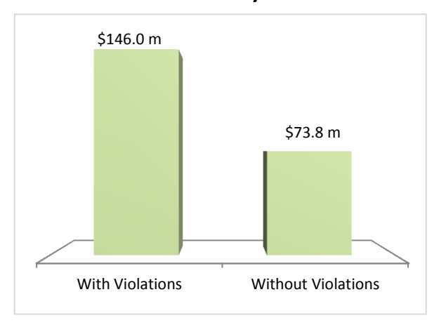
Figure 2 – Money Awarded to the 158 Vendors by DGS

The majority, 66 percent, of the more than $219 million awarded by DGS over the past five years, was awarded to vendors with OSHA violations in the past 10 years. In total, $146 million in taxpayer-funded contracts was awarded to vendors with OSHA violations.