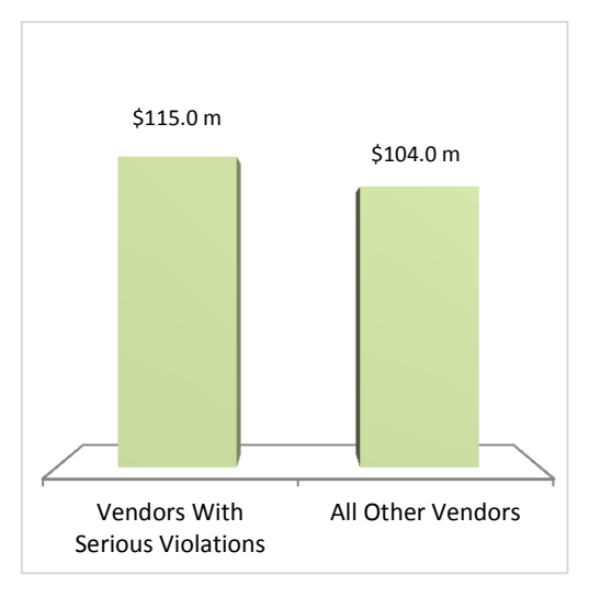
Figure 4 – Money Awarded to Vendors by DGS

More than half, 53 percent, of the money awarded by DGS in the past five years to the 158 vendors was awarded to vendors with serious OSHA violations in the past 10 years.