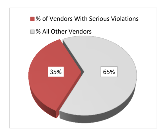
Figure 3 – Percentage of Vendors With Serious OSHA Violations

Thirty-five percent of the 158 vendors that have been awarded contracts worth $100,000 or more have received serious OSHA violations in the past 10 years. [See Figure 3]