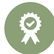
HEALTH CARE VALUE