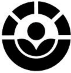
The Kadura International Symbol for Irradiation