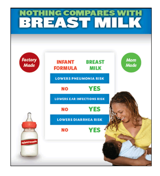
Posters were placed in hospitals and subway stations to raise awareness of the benefits of breastfeeding.

During the campaign announcement at Harlem Hospital, Commissioner Thomas A. Farley explained that the distribution of infant formula marketing is harmful to new mothers and babies. "When babies receive supplementary formula in the hospital or mothers receive promotional baby formula on hospital discharge it can impede the establishment of an adequate milk supply and can undermine women's confidence in breastfeeding," he said. "With this initiative the New