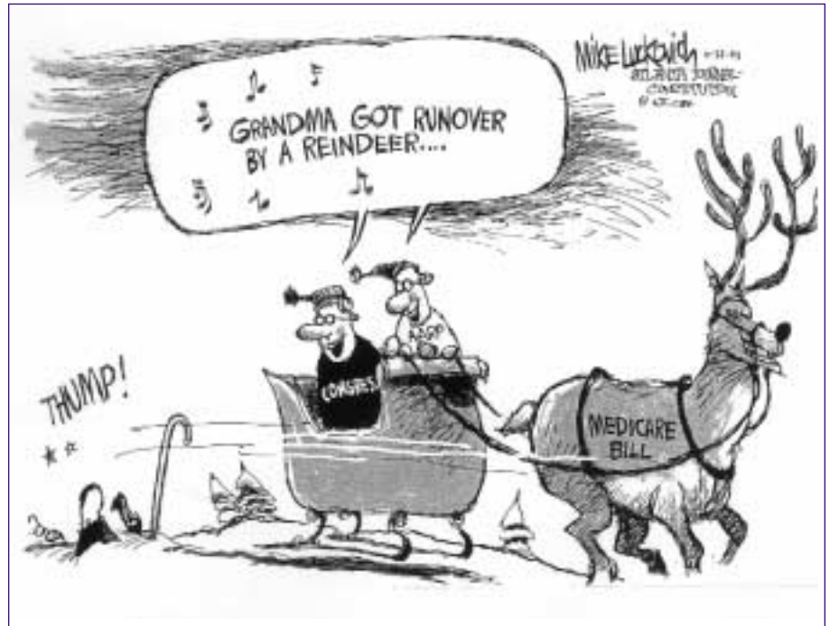
By permission of Mike Luckovich and Creators Syndicate, Inc.