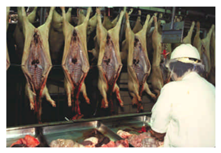
"GIPSA officials find it hard to think that packers could act in an anti-competitive manner, preferring to believe that economic forces or random factors are always the explanation for suspicious market trends."

Tyson, Smithfield, Excel and the other major packers use their economic power to make sure they are buying livestock from ranchers and farmers on the most advanta-